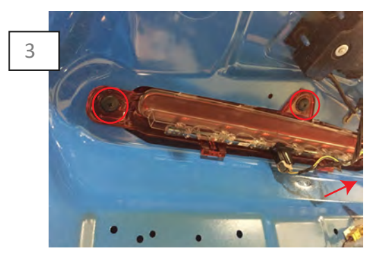
Unscrew the 3 plastic Phillips screws to remove the 3rd brake light.