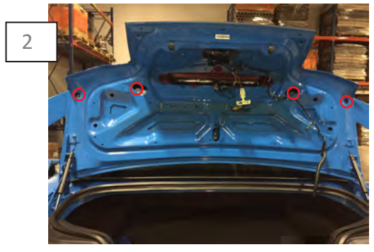
Remove the (4) factory spoiler fasteners and remove it from from car. **Note: An extra set of hands is very helpful when removing the spoiler.