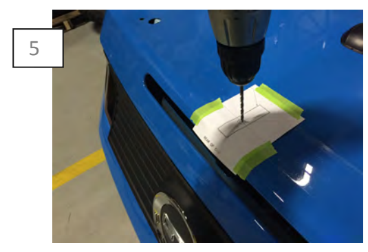
Using the template as a guide, drill a pilot hole, finishing with a 3/8 in" diameter hole. Remove any burrs using a file. **Note: It is recommended that you apply paint to any bare metal around the hole to prevent corrosion.