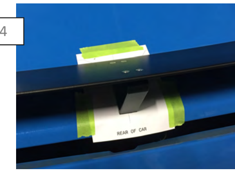
Loosely install the spoiler using the standard 4 mounting points. Align the supplied template with the base of the center most mounting bracket. Tape the edges of the template as seen above so that the template remains in place when the spoiler is removed. Then remove the spoiler.