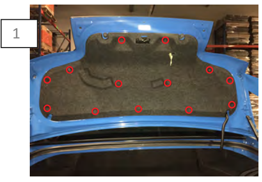
Begin by removing the deck lid liner, use a panel removal tool to remove the plastic clips.