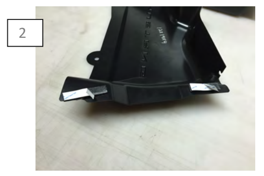
Cut the supplied velcro to length. Clean the mounting surface with the supplied alcohol wipe. Allow the part to dry. Then apply the velcro strips. Peel the adhesive backing off the velcro.