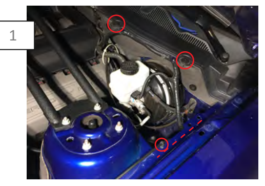
Remove the (2) Plastic factory cowl screw clips. Remove the clip holding the hood latch cable to the fender. Clean the velcro mounting surface on the fender (dashed line above).