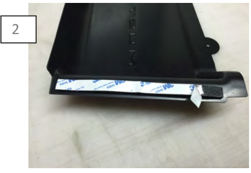
Cut the supplied velcro to length. Clean the mounting surface with the supplied alcohol wipe. Allow the part to dry. Then apply the velcro strip. Peel the adhesive backing off the velcro.