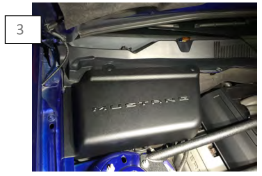
Position the part on the car so that the (2) mounting holes line up. Using the supplied push pins, install the battery cover. Then apply firm even pressure to the velcro to ensure proper adhesion.