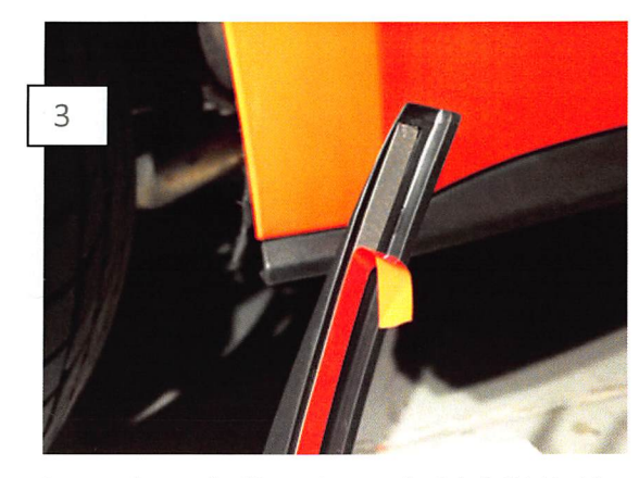
Remove the tape backing and mount the Splash Shield with the supplied push pin. Apply firm even pressure to the taped surface to ensure proper adhesion.