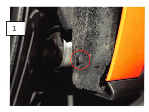
Raise and support the rear of the vehicle. Remove the factory splash shield retaining clip.