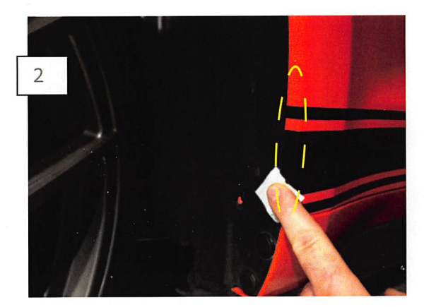
Using the supplied alcohol wipe clean the mounting location allow time for the surface to dry. Then apply the supplied adhesion promoter and allow it to haze.