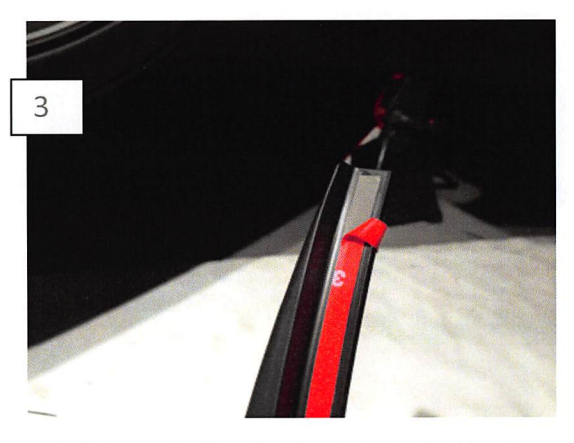
Peel off the tape backing. Position the Splash Shield and secure with the supplied push pin. Apply firm even pressure on the double sided tape to ensure proper adhesion.