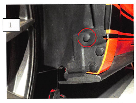
Raise and support the front of the vehicle. Turn wheel for better accessibility to the mounting locations. Begin by removing the factory push pin circled above.