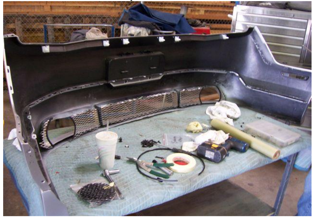
You can see the white Clips where the top snaps into place.

About Four Bolts hold each side into place.