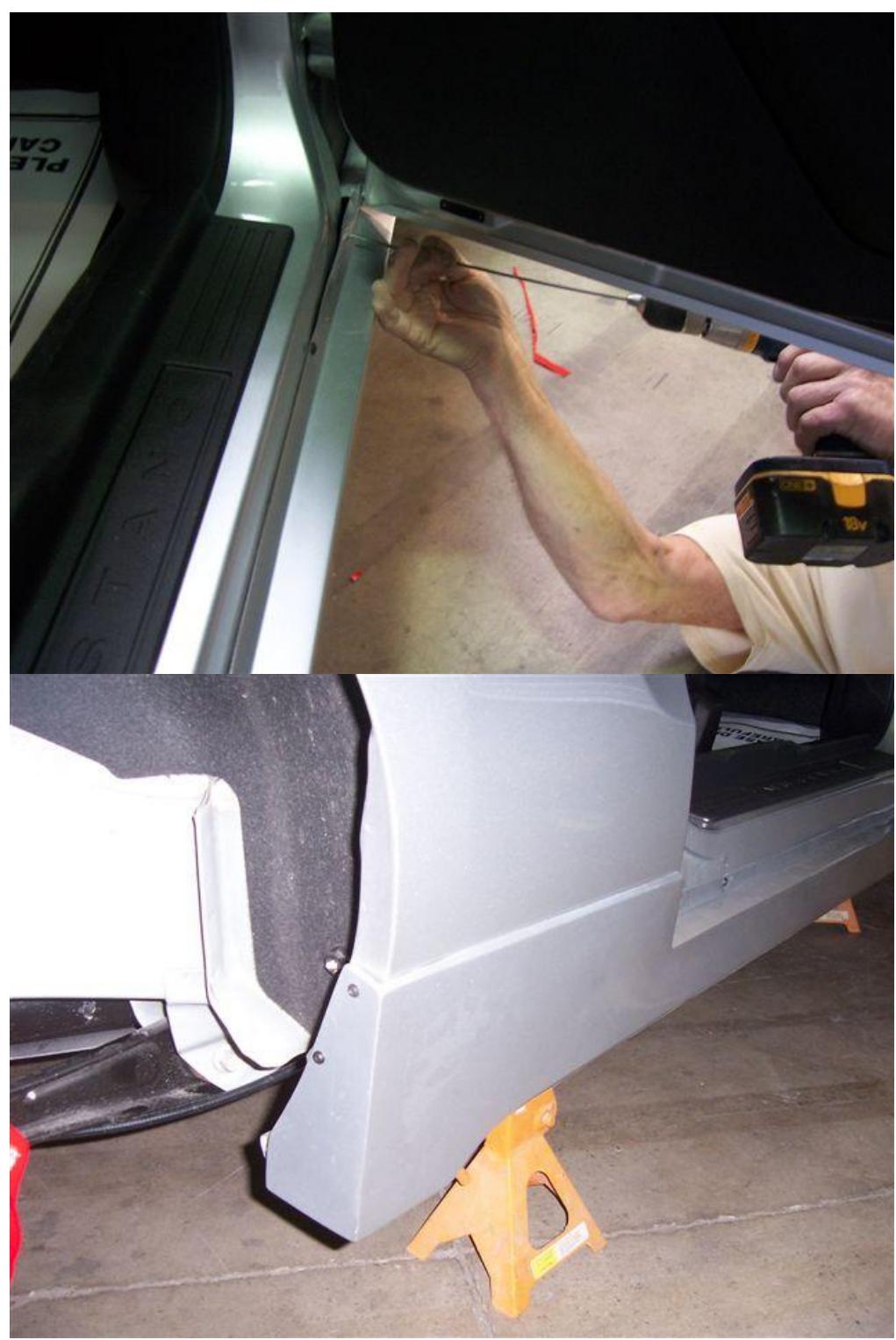
Two Screws on each side on the fender wells, self tap screws work okay here, but you can make a pilot hole if you want too.