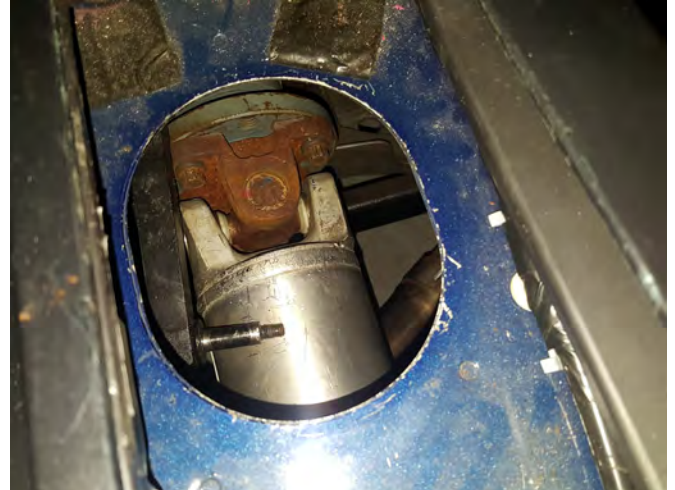
Step 6: Maneuver the shifter forward, pull back and up through the opening to remove it from the vehicle.