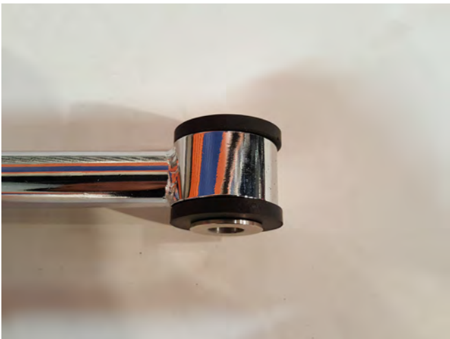
Step 7: Remove the rubber bushings from the factory shifter arm, and insert them in the new SR Performance shifter arm.