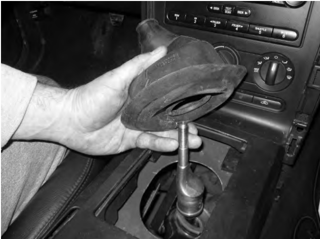
Step 5: Remove the lower shift boot by pulling up.