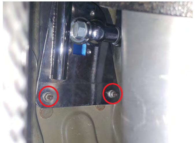
Step 8: Insert the SR Performance shifter into the body opening, and place it with the mounting bracket towards the rear of the vehicle. Install the (2) rubber bushings in-between the base of the shifter and the body of the vehicle. Secure the rear part of the shifter base using the (2) 10mm factory nuts.