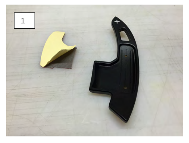
Clean the paddle extension with the supplied alcohol wipe allow time to flash dry Then peel back the adhesive backing and apply the double sided tape to paddle extension.