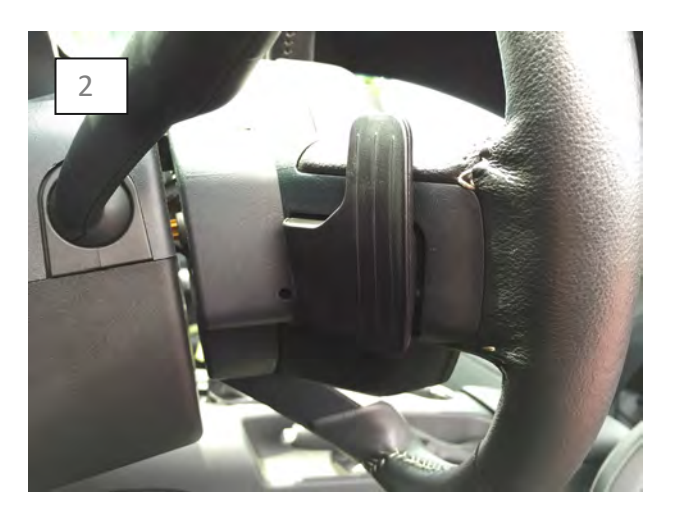
Clean the mounting surfaces with the supplied alcohol, allow time to flash dry.