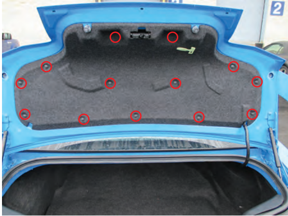
Step 1 Open the trunk and remove the (13) push pins securing the trunk lid panel to the trunk.