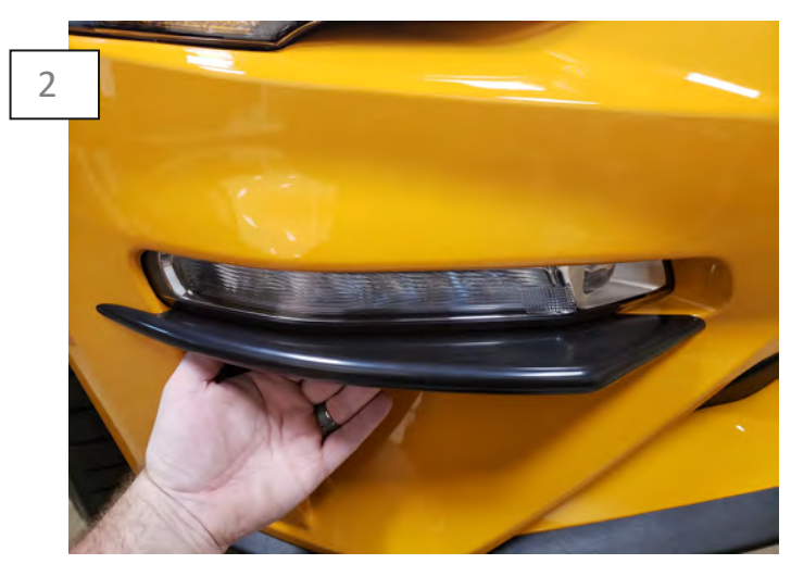
Before installing the bumper winglet, test fit the winglet to familiarize yourself with where it fits best.