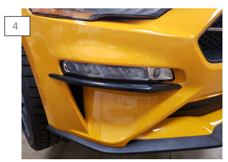
Remove the tape backing and Install the winglet to the under side of the light. Apply firm even pressure to the taped surface to ensure proper adhesion.