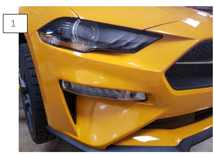
Begin by throughly cleaning the bumper with soap and water. Allow time for the bumper to dry. Using the supplied alcohol pad, clean under the light surface on both sides.

Contents: (1) Pair Winglets (1) Tape Roll (1) Alcohol Pads