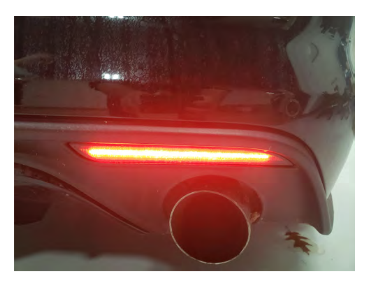
Step 5 \\ Test the lights for proper function. Installation is now complete.