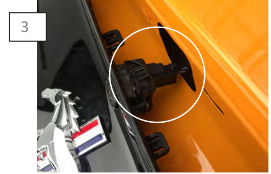
Unplug the reverse camera and remove the panel from the vehicle. Remove the (2) 5.5mm screws securing the camera to the panel. **Note the orientation of the camera. If reinstalled backwards the camera will be inverted on the display. Reinstall the factory camera onto the MMD panel reusing the factory screws.