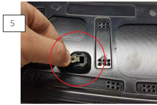
Remove the (4) factory screw clips across the bottom of the decklid panel. Transfer these clips onto the MMD panel.