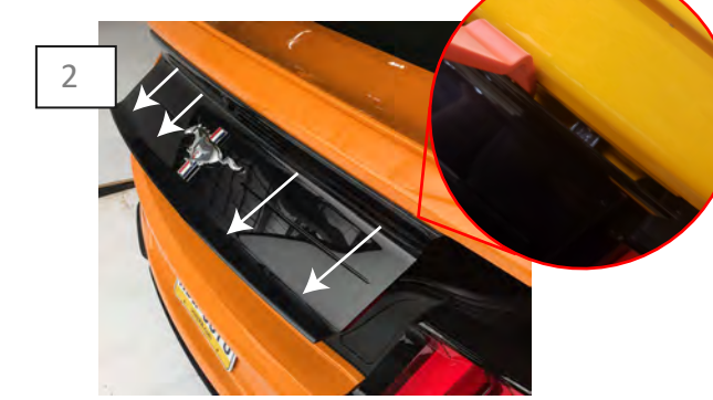
Using a panel removal tool, carefully separate the factory deck lid panel from the deck lid. It is clipped into the decklid along the top edge. **Note: Do Not pry against the paint, decklid dents easily.