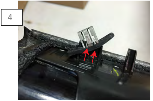
Remove the factory (4) push clips across the top of the decklid panel. Transfer these clips onto the MMD panel.