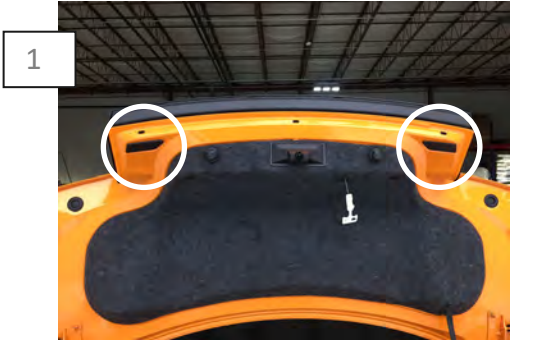
Using a panel removal tool, gently remove the caps covering the deck lid panel screws. Remove the (4) 7mm screws.

RE QUIRED: Panel Removal Tool 5.5mm, 7mm 1/4" Sockets Flat Head Screw Driver 1/4" Ratchet