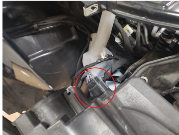
Step 8 Once the headlight is unbolted from the vehicle unplug and remove the wiring harness from the light.