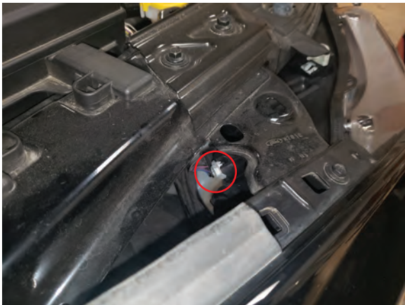
Step 10 Using a Phillips or Allen key, use the attached adjustment screw to adjust the headlight to the factory specifications which can be found in the owners manual.