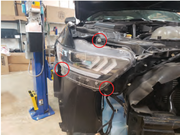
Step 7 Remove the factory headlight from the vehicle using a 10 and 13mm socket.