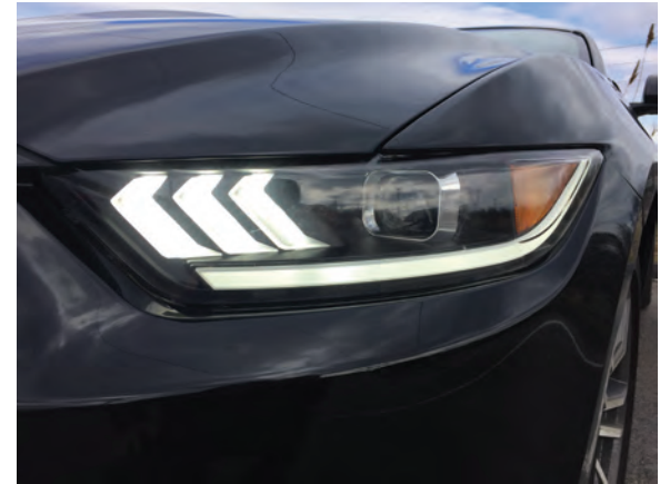
Step 9 Install the Raxiom headlight in reverse order using the factory mounting hardware.