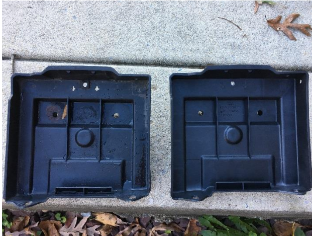
This is my old tray (left) vs the new tray from American Muscle (right)

This is a guide for removing and replacing the battery tray on any 99-04 Mustang. Remember to keep all existing hardware as new hardware is not included with the purchase of a new tray. Some of the hardware is likely to be very rusty, so new hardware from Ford might also be a good idea.