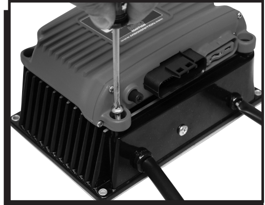
Figure 3 Mounting

The Power Grid System Controller (PN 7730) is designed to be mounted on top of the PN 7720 Ignition. Be sure to mount the Power Grid System Controller so the USB connector and Micro-SD card are accessible. The PN 7730 comes with thread-turning (aka. Self-tapping) screws that will cut into the walls of the pre-drilled holes on the top corners of the Power Grid-7.