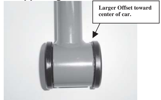
Left Rear Underside Section Shown

6. Install the control arms with the thicker shoulder at the axle end. Then the larger offset of the axle end shoulder point towards the center of the car. Also the supplied washers are used on the front Mounts facing towards the outside of the vehicle.