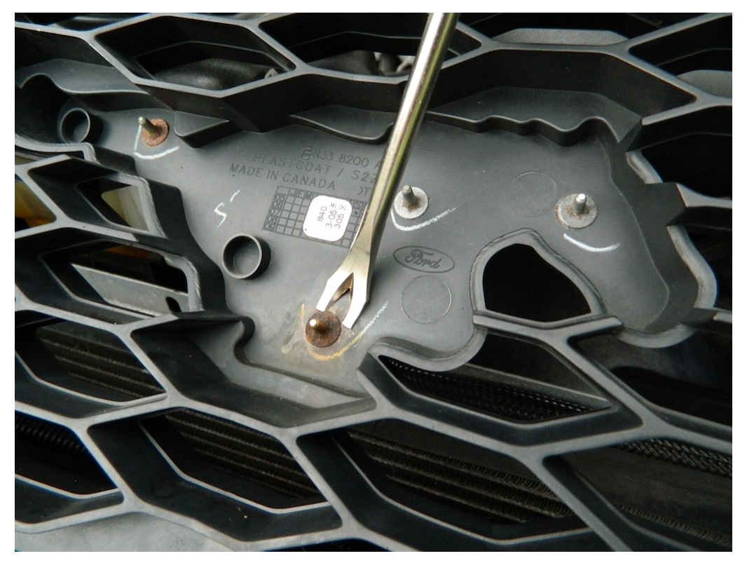
(Optional) Install Tri-Bar Grille Emblem Installation Guide Link: <u>http://www.americanmuscle.com/tribar-grille-emblem-install.html</u>

4. Remove chrome running pony using a tack puller, slide under retaining pin and wiggle off clip carefully. Note: Pins are made of plastic and will snap if not done slowly.