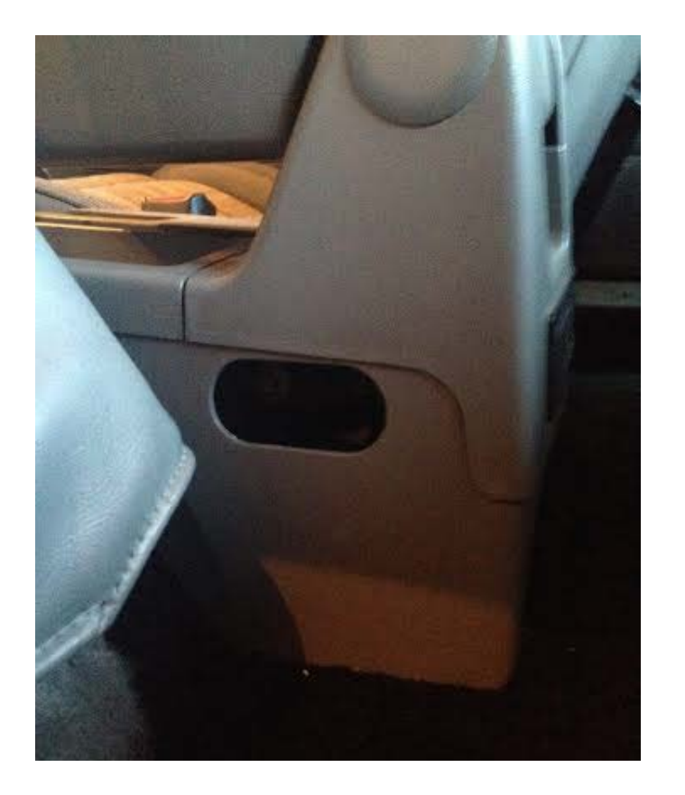
Step 1: Take a flat head screwdriver or a knife to pry one side of the plug out of the console.

If your center console is missing the oval access plug skip to the Installation procedure.