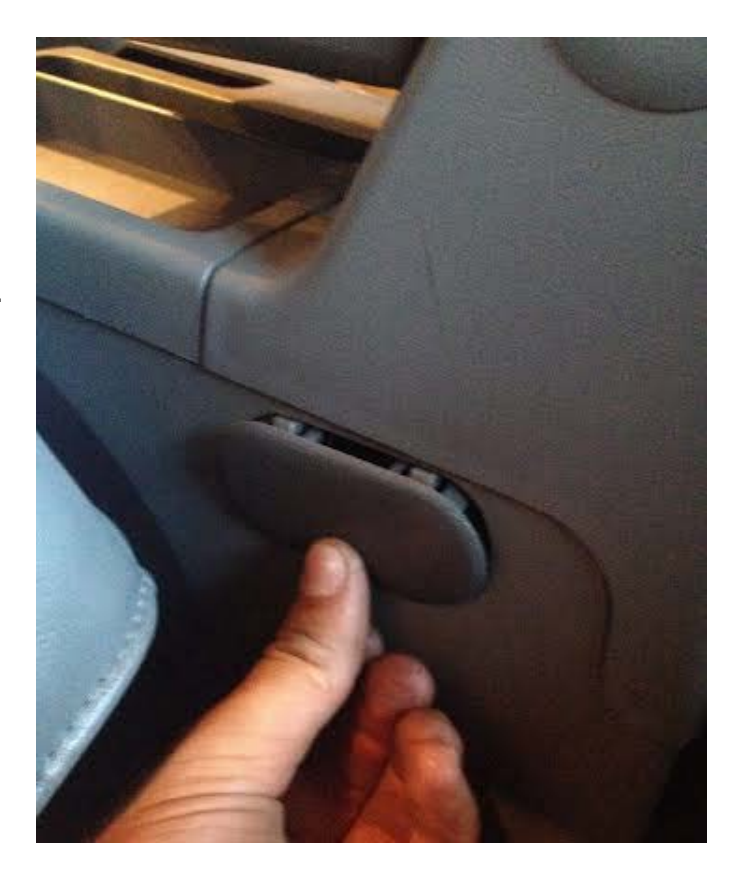
Step 2: Take your finger and push on the top of the plug to seat it in the console.

Step 1: Take your new console plug and insert the bottom two tabs in the console.