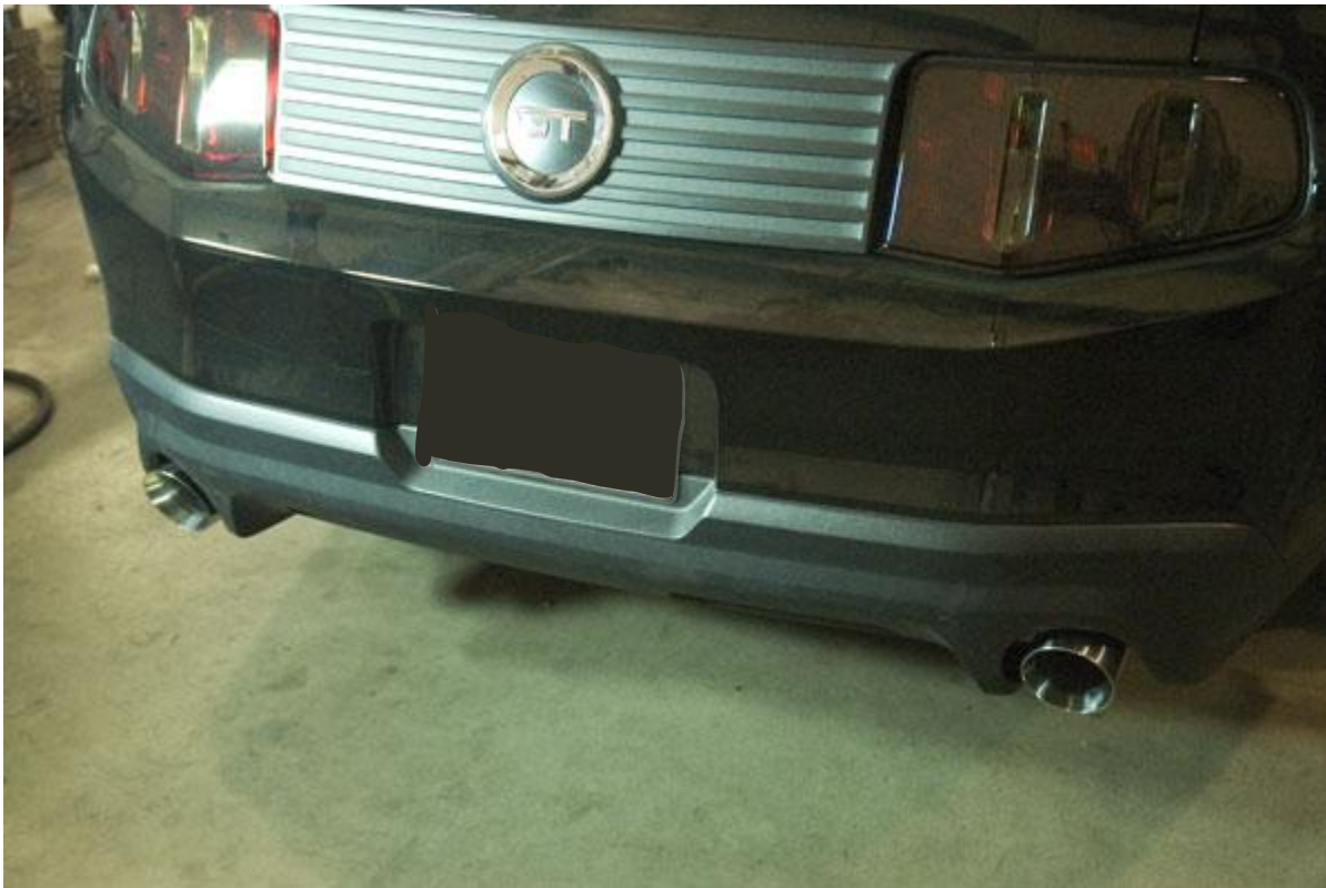
Figure 2: Finished Installation