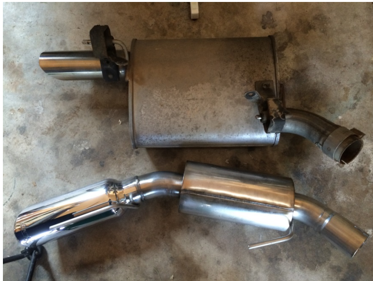
(Side by Side comparison of factory axle-back and Borla Stinger axle-back)