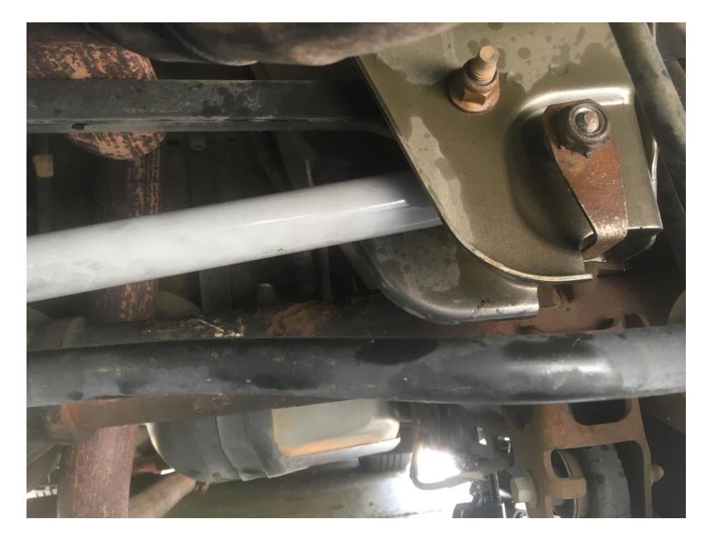
*The panhard bar may need to be adjusted for proper alignment of hardware holes*

8. Place the RTR Panhard bar into the passenger side mount and insert the bolt and locking tab nut.