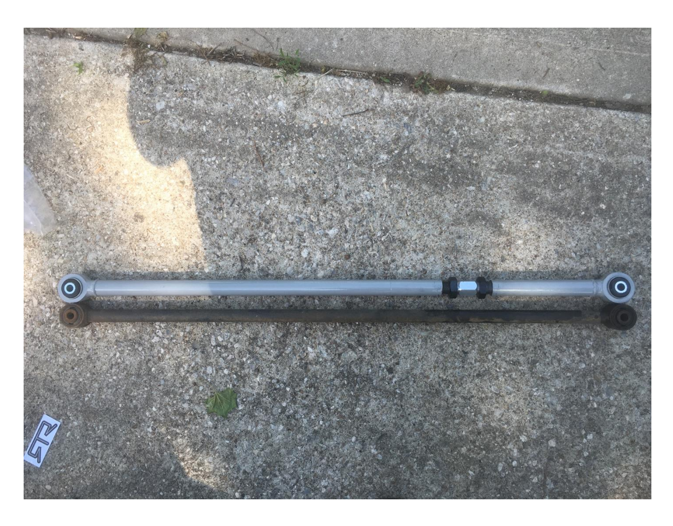
*Adjust the RTR Panhard bar by loosening the two locking bolts and rotating the center adjustment bar*