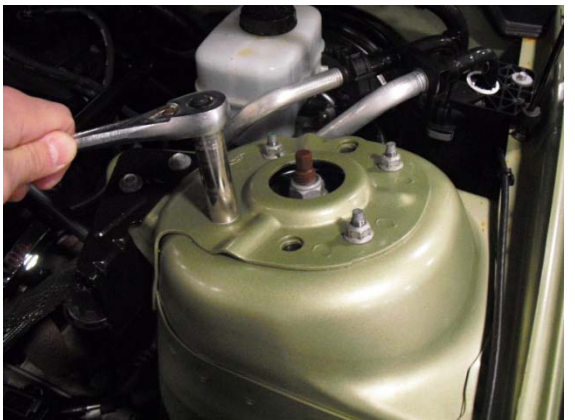
Step 2: Place strut bar over strut mount studs and re-install 13mm nuts removed in Step 1.