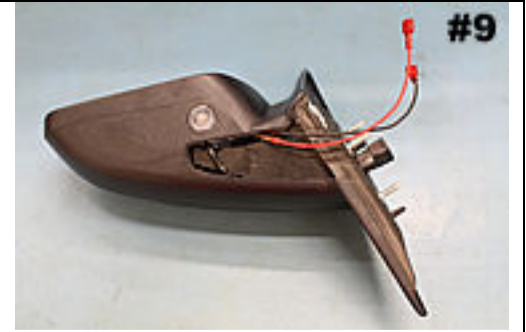
Mount the lamp using the white nut provided, then route wiring as shown.