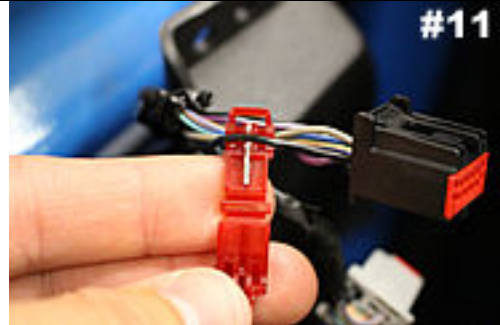
Slide wire into place and close wire tap firmly.