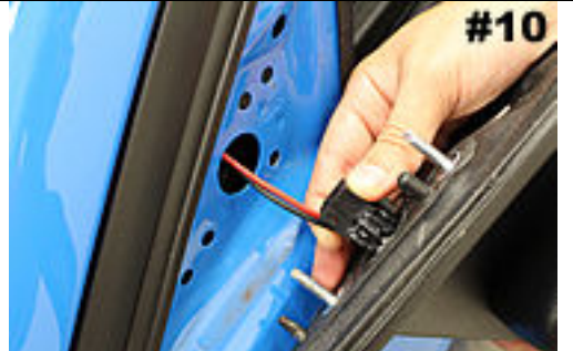
Lamp wiring goes through same hole as the mirror's electrical connector.