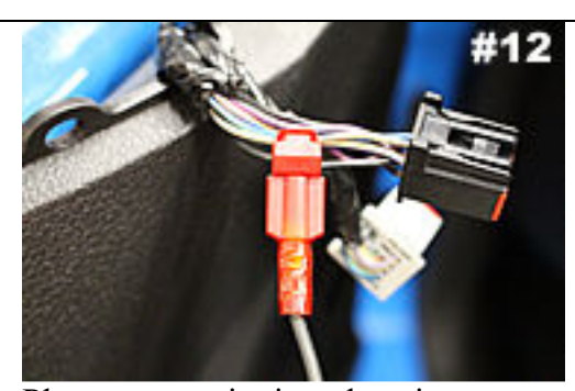
Plug correct wire into the wire tap as indicated in manual.