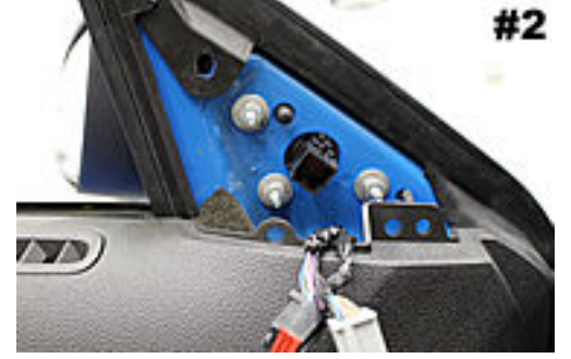
Remove the 3 - 11mm nuts holding mirror on. Don't drop the nuts!