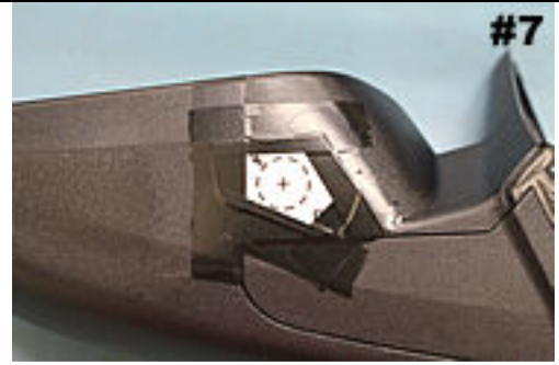
Bottom of driver side lamp with drilling template attached.