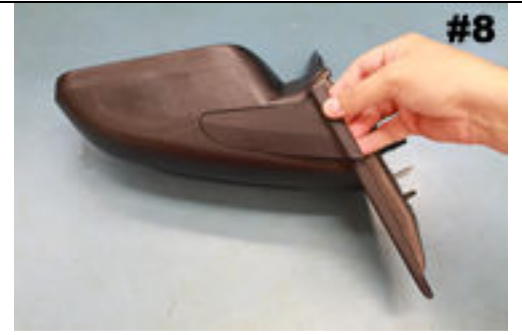
Remove the rectangular access cover on the bottom of each mirror.