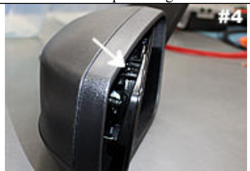
Shows top retaining tab. Insert flat head screw driver here to release tab.

4. Repeat the glass removal on the opposite side-view mirror.