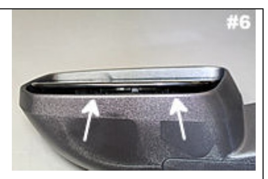
Bottom view of Drivers side mirror. Arrows point to 2 of 3 retaining tabs.