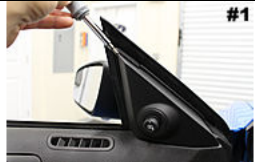
Pry off access cover. Be gentle and cautious when doing so.

3. After removing the first side view mirror, repeat the process on the other side of the car.