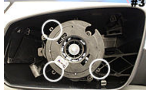
3 Retaining tabs (circled) hold the mirror glass in place.