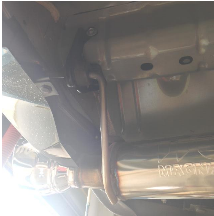
Figure 13 – Hanger System for Right Muffler/Tailpipe Tightened Up (Step 15)