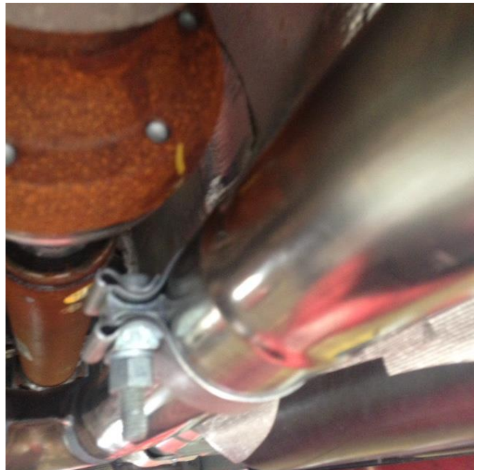
Figure 12 - Rotate Clamp to avoid undercarriage snags