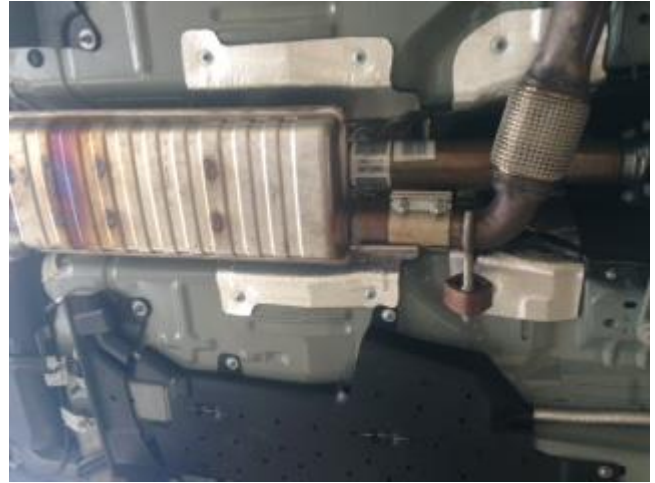
Figure 2 Resonator and clamp on right