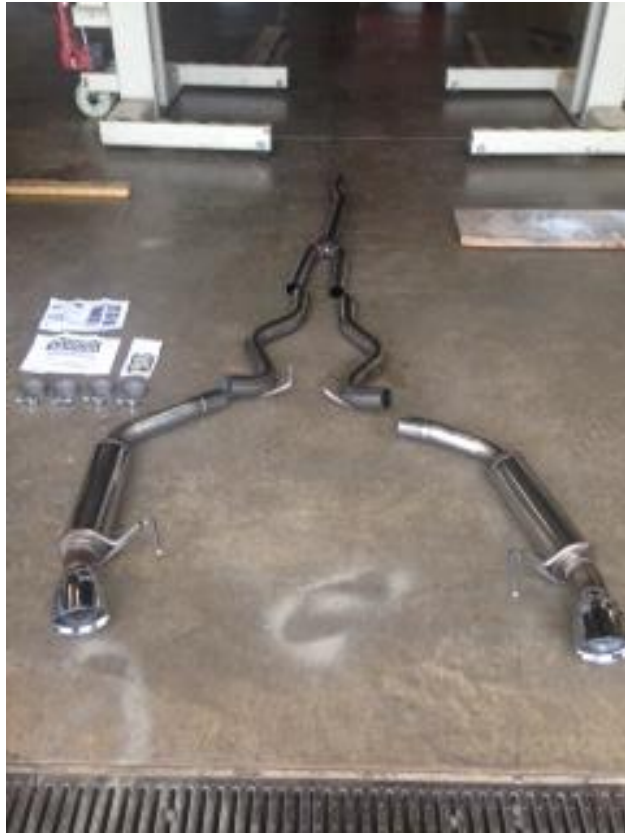
Figure 9 - New Magnaflow System Laid Out