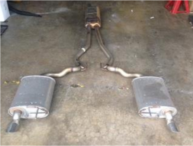
Figure 1 Existing 2016 Ecoboost System Completely Removed