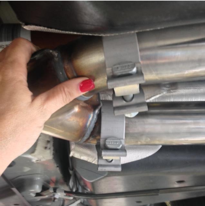
Figure 11 - Clamps slid on Y-Pipe for Attaching Midpipe Extension