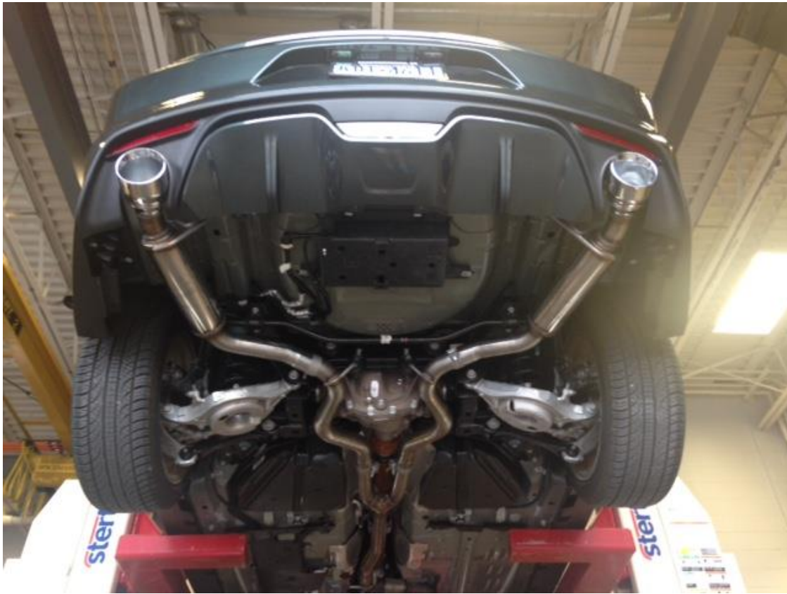
Figure 14 - Final Magnaflow System Installed. Giddy Up.