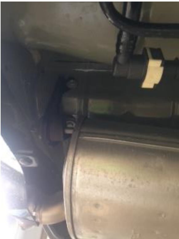
Figure 7 - Hanger/Bolt to be removed left of Muffler