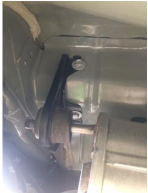
Figure 8 - Close up of Muffler Hanger Rubber Doohicker