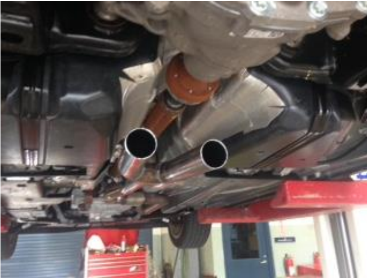
Figure 10 - Y pipe installed (Step 8)