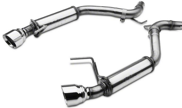
Magnaflow Competition Series Axle-Back (Part No.19179)