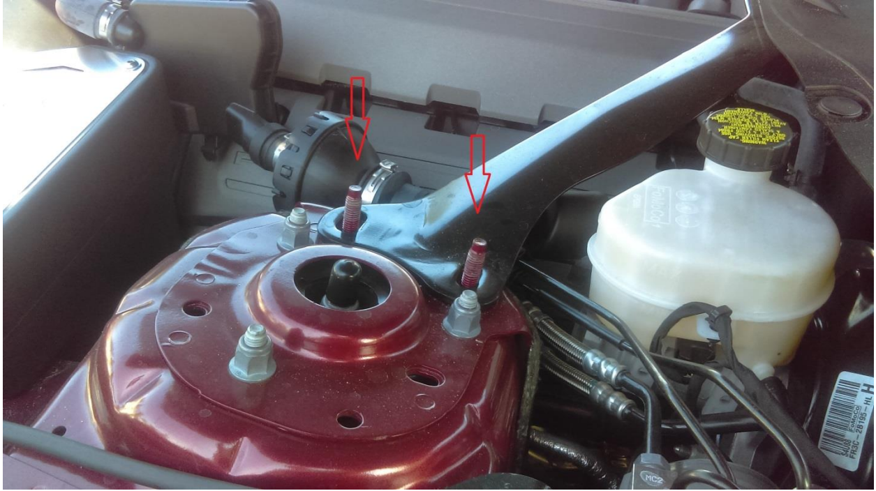
Step 2: Thread on 2 strut tower nuts on each side and torque to 41ft/lbs