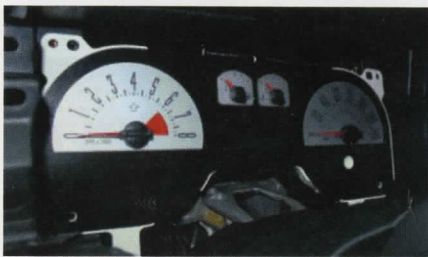
20. Plug the cluster back in. Each needle should go back to the low marks.