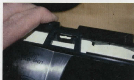
8. Remove the top lens. I is only held on with clips.