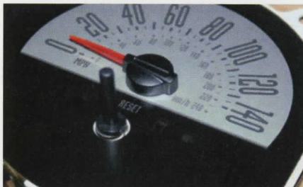
24. Some models have the reset button, set in place.