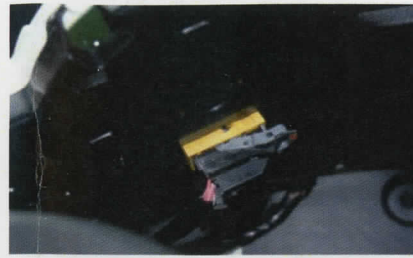
18. Unplug the cluster.