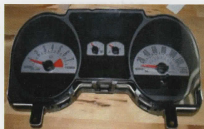
25. Snap the lens in place and install the cluster.

Tools required: 7mm socket. Time to complete : 20-25 minutes