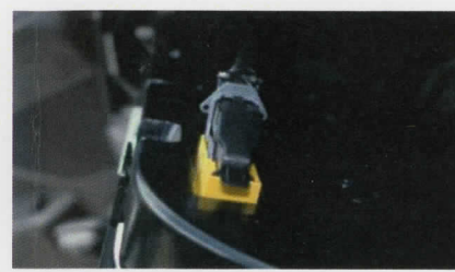
6. Push down on the center and slide the handle over to remove.