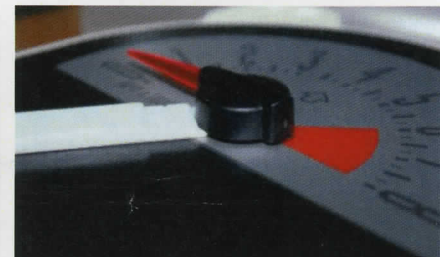
23. Push the hub down until it makes contact with the handle of the needle tool.