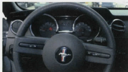
1. Mark on the diagram each needle location. Key OFF