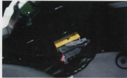
21. If a needle is wrong, unplug the cluster and remove the needle.