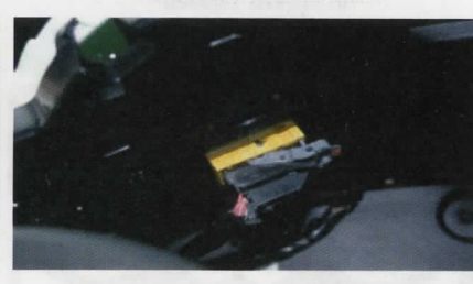
15. Leave the key off and plug the cluster in.