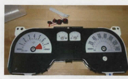
14. Place the gauge face in place. SS and Aqua kit will come with gloves.