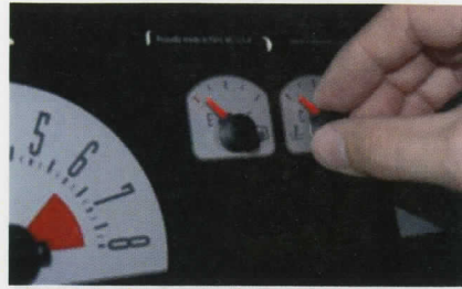
17. Do not push all the way down yet.