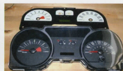
7. Take the cluster to a clean work area.