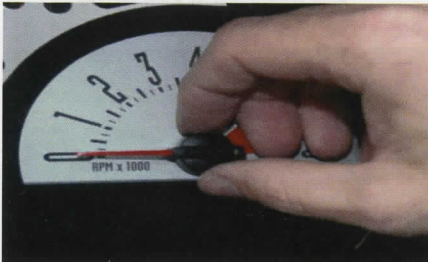
16. You will hear the motors reset. Place the needles into position.