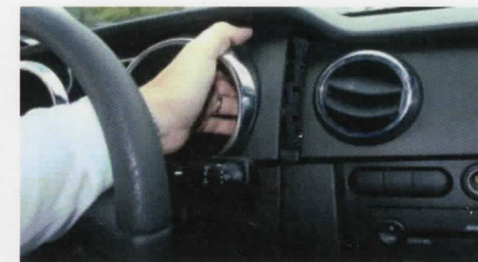
3. Pull on the right side of the vent.