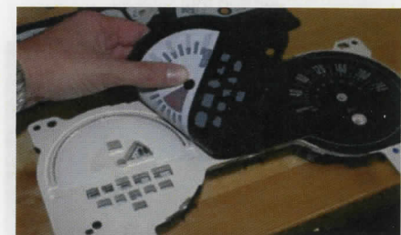
12. Remove the black gauge face. It has glue on the back of the gauge face.