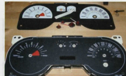
11. Use the needle tool to remove the needles, twist and lift if needed.