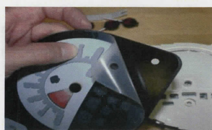
13. On the back of the US Speedo gauge is a clear liner. Remove.