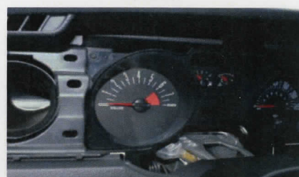
5. Remove the four 7mm screws holding the cluster in place.