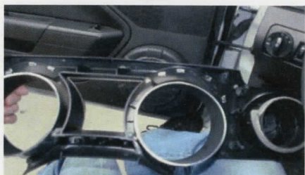
4. Slide the trim piece to the left to remove. It only has clips to secure it.