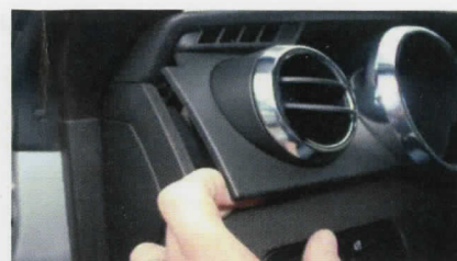
2. Pull on the left side of the vent.