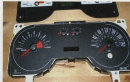
10. Turn the needles down past the low marks.