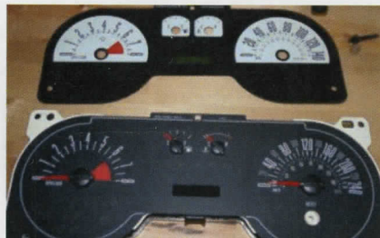
9. Only remove the top lens.