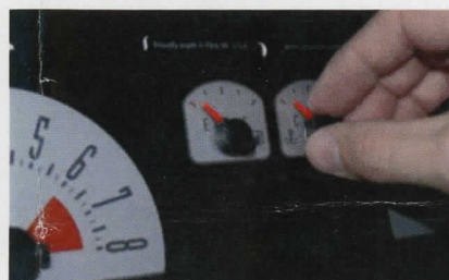
22. Return to step 15 if a needle is wrong. If not, continue.