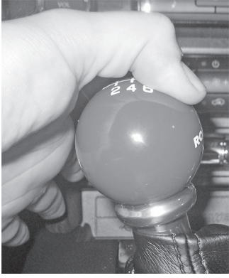
Congratulations!!! You have completed the installation of the ROUSH Performance Products, 2015 Ford Mustang shift ball.