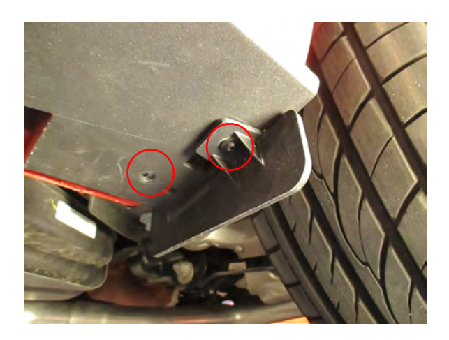
Step 1: Remove two torx screws and plastic retaining clip holding the plastic splash shield. Remove shield