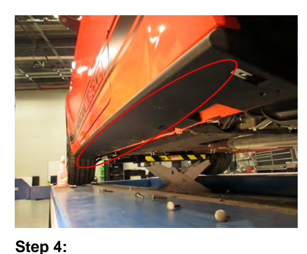
Peel back the red plastic film to expose the double sided tape. **Note: only peel off enough to get it started. Install the Rocker splitter using the factory retaining clips. Once the splitters are where you want them, peel the red film off and apply firm even pressure.