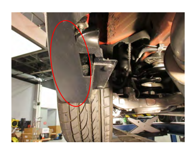
Step 6: Clean the area the tape will mount to using the supplied alcohol swab and adhesion promoter.