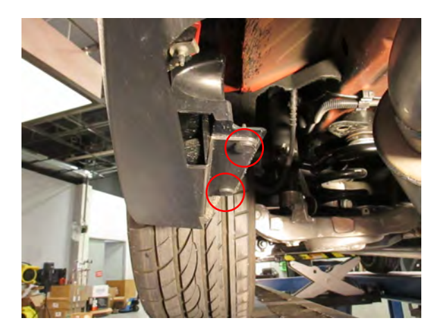
Step 5: Locate and remove the two plastic push clips that fasten the rear bumper.