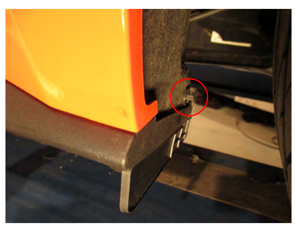
Step 2: Remove the 8 clips securing the plastic radiator cover to the support and remove it from the vehicle.