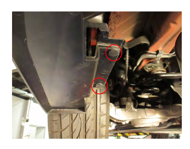
Step 7: Secure with factory plastic push clips. **Note: push clips will be tight and will require more pressure to seat the clip.