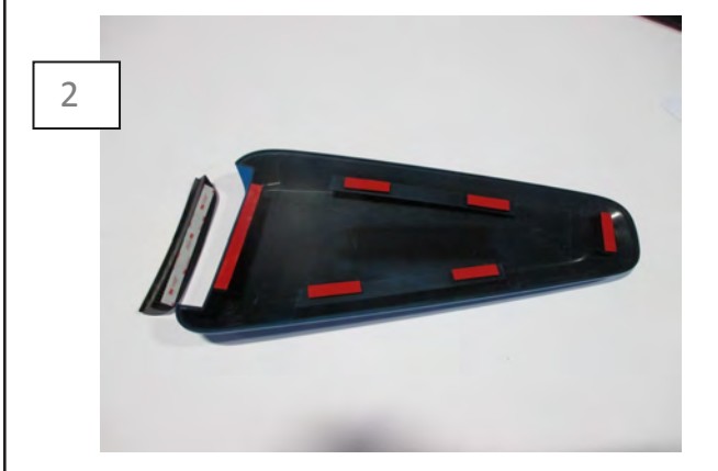
Apply the Supplied tape as seen above.