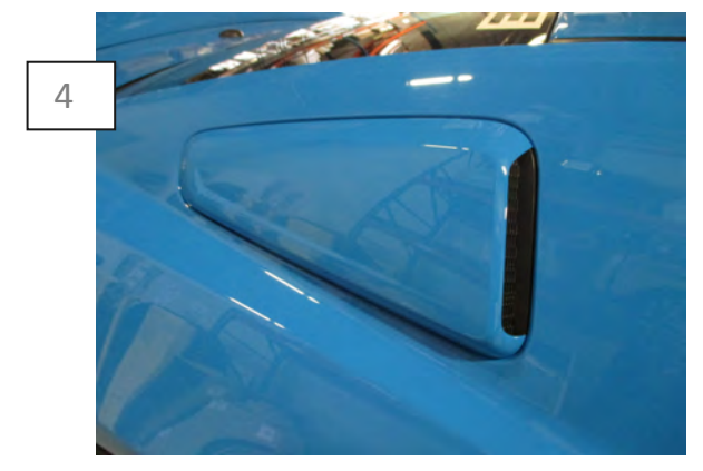
Test fit the scoop and note how the scoop fits to the window. Then remove tape backing, apply the scoop to the window using firm even pressure.