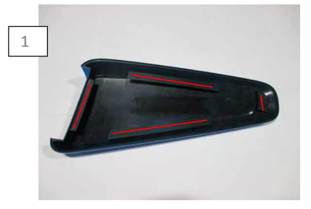
Wipe the tape ledges on the Scoop and window glass with provided alcohol wipes followed by adhesion promoter. **Note: A clean surface is essential for proper adhesion