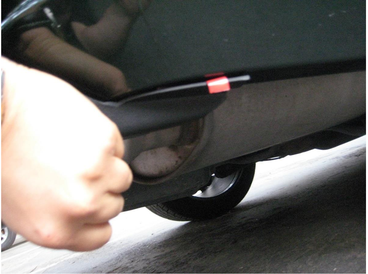
This is on the driver side of the exhaust pipe.