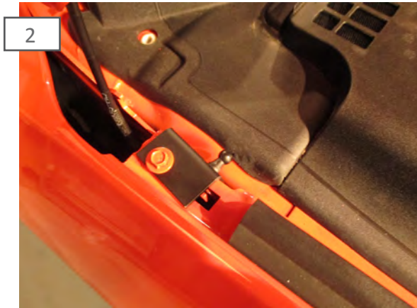
Re-install fender bolt through the lower strut mount bracket.