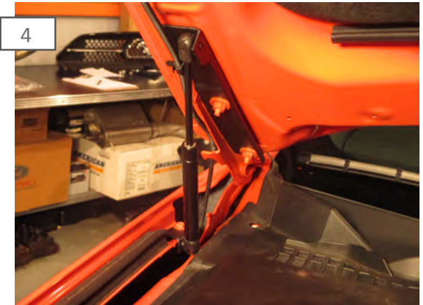
Install supplied gas strut onto mounting brackets. **Note: slowly close hood to make sure the hood clears the fender. Re-alignment of the hood may be required if the hinge shifted during install.