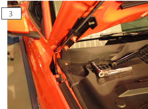
Slide the bracket between the loosened hood nut, and the hood hinge. Then reinstall remaining hood nut. **Note: Passenger side bracket will require you to remove the windshield washer hose retaining clip.