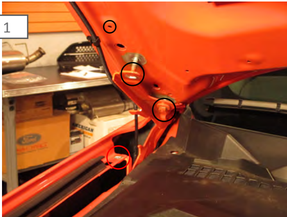
Remove the rear most 10mm fender bolt. Remove the forward most 13mm hood nut. Loosen the rear most hood bracket nut so that you can slide the upper mount bracket on.