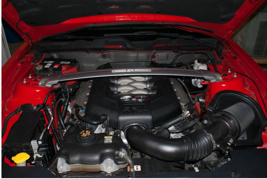
Installation Guide Created and Submitted by AmericanMuscle Customer, Leo Haddad, on 9/10/2016