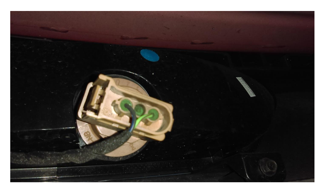
Step 3: Replace factory bulb with new LED and re-install in reverse order