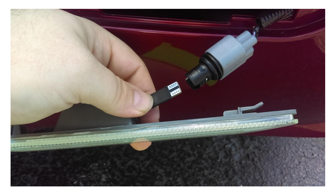
Step 4: Test your lights prior to inserting.