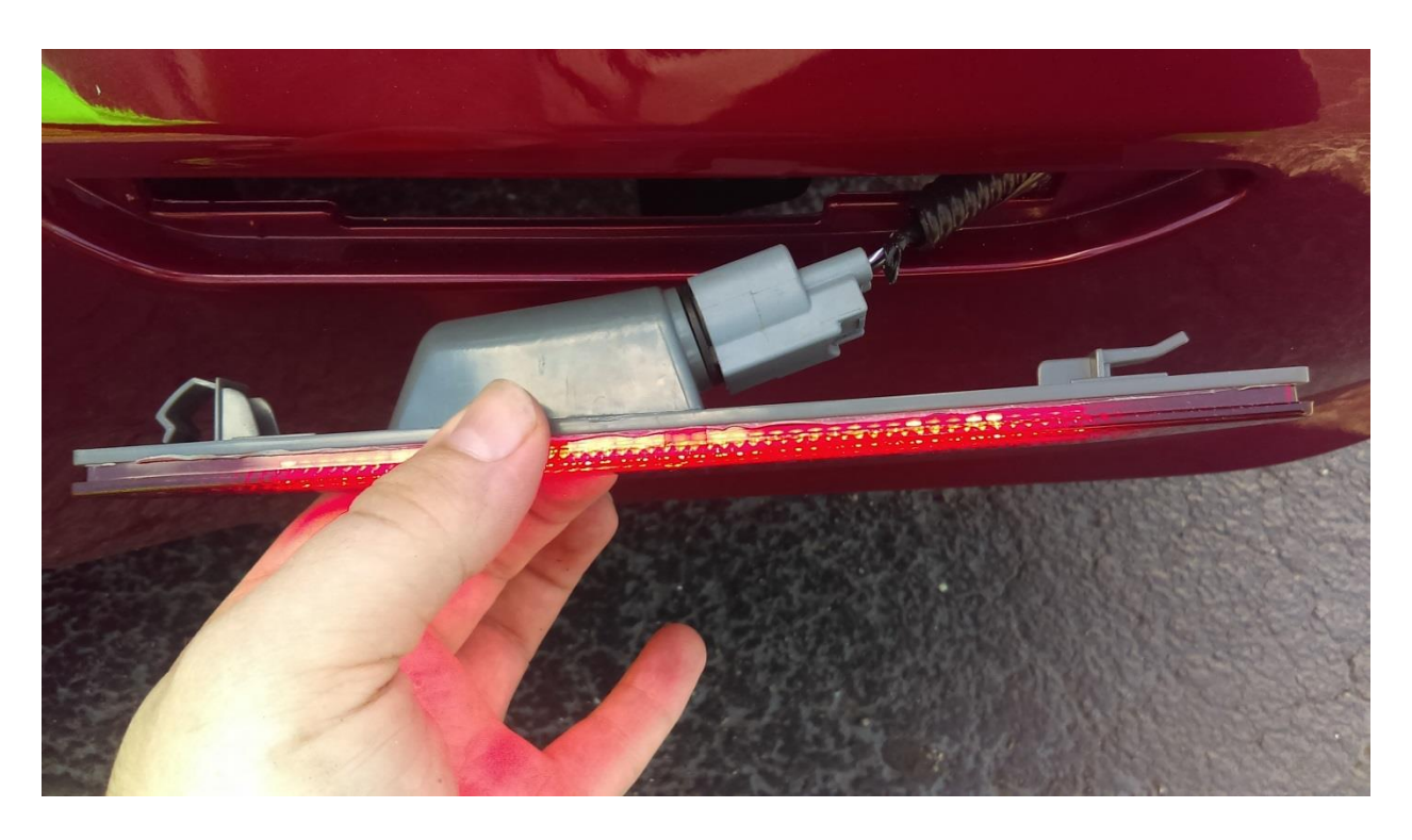
Step 3: Remove bulb/LED housing from the connector and plug in your new unit.