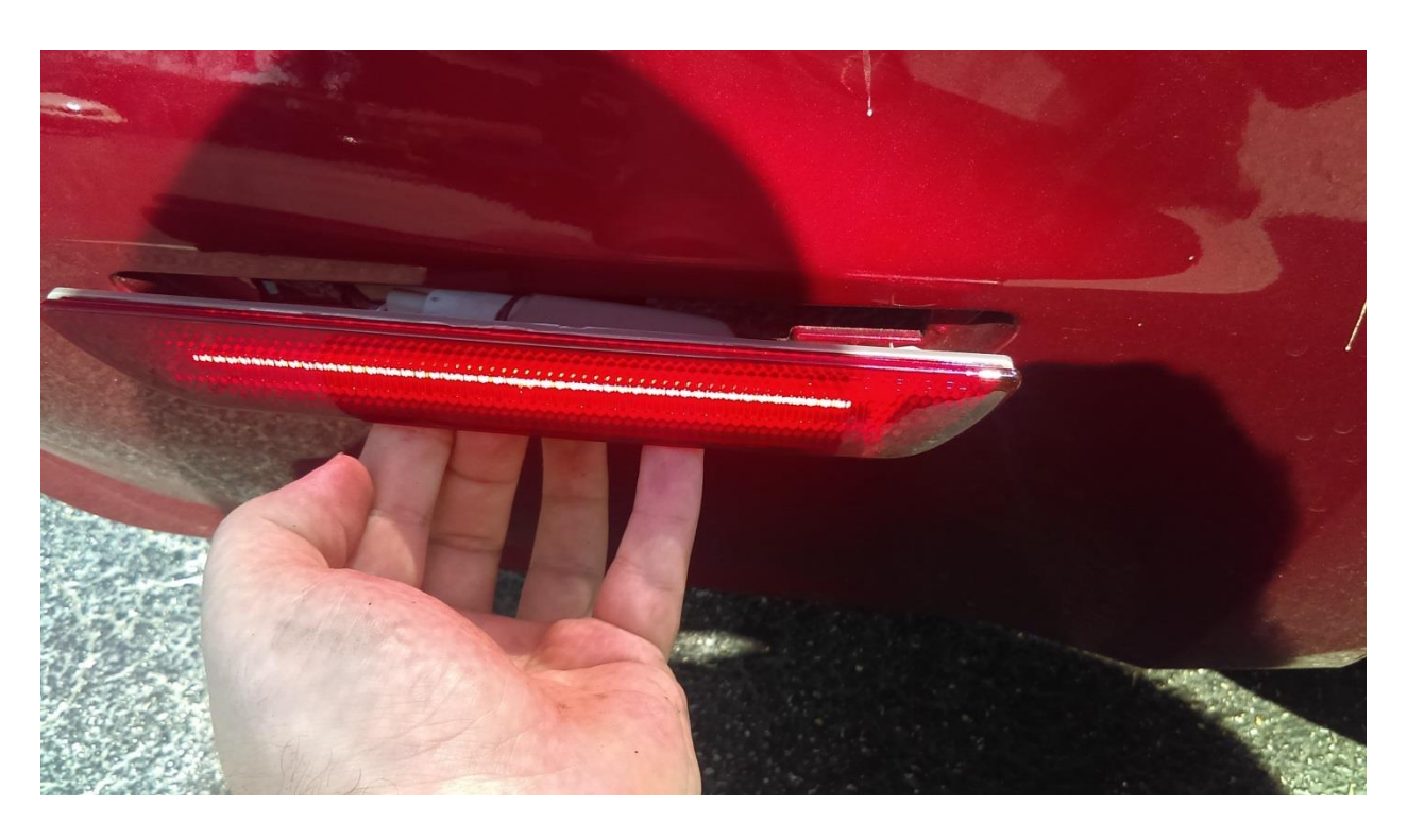
Step 5: Reinstall new light housings in reverse order from removal.