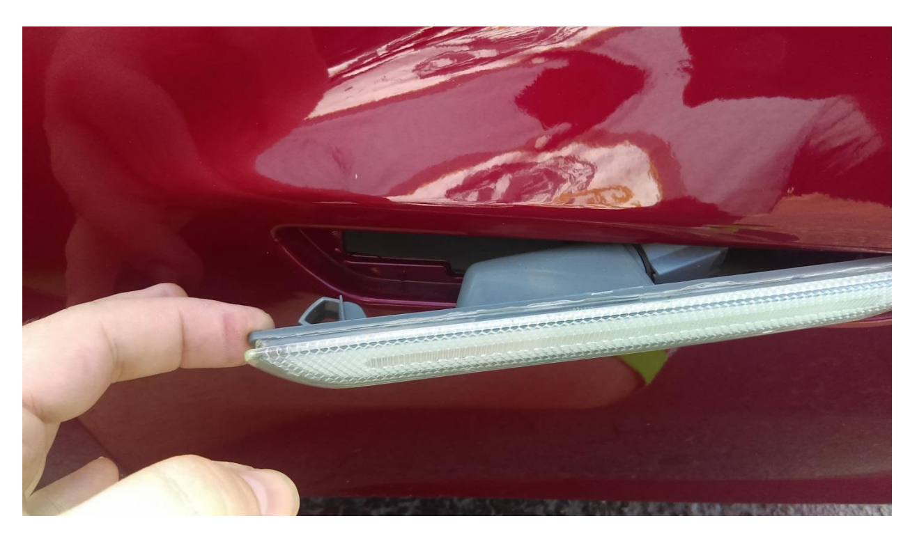
Step 2 : Pull out on the side closest to the tire and slide it towards the wheel until it comes free.