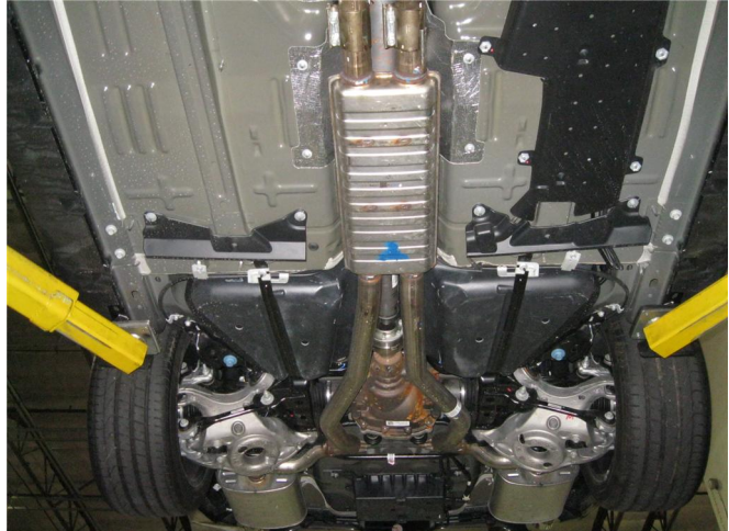
Step 1. Begin removing the OEM exhaust system by loosening the clamps located in front of the resonator. Next working front to rear extract the hangers from the rubber insulators and remove the OEM system. Retain insulators and clamps as they will be used to install the new system.