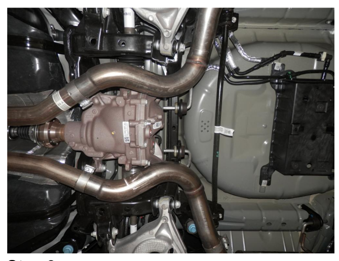
Step 3. Next attach the Mid Pipe Assemblies to the X-Pipe using the supplied 3.00" clamps and fitting the hangers into the rubber insulators.