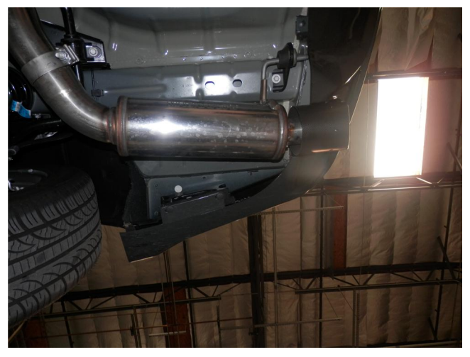
Step 4. Finish the initial installation by fitting the Muffler Assemblies onto the Mid pipe Assemblies using the supplied 3.00" clamps and inserting the hangers into the rubber insulators.