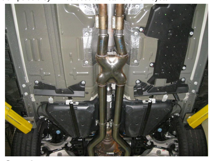
Step 2. Begin installation of the new system by loosely attaching the X-Pipe Assembly to the outlets using the OEM clamps. Leave all clamps loose until final adjustment.