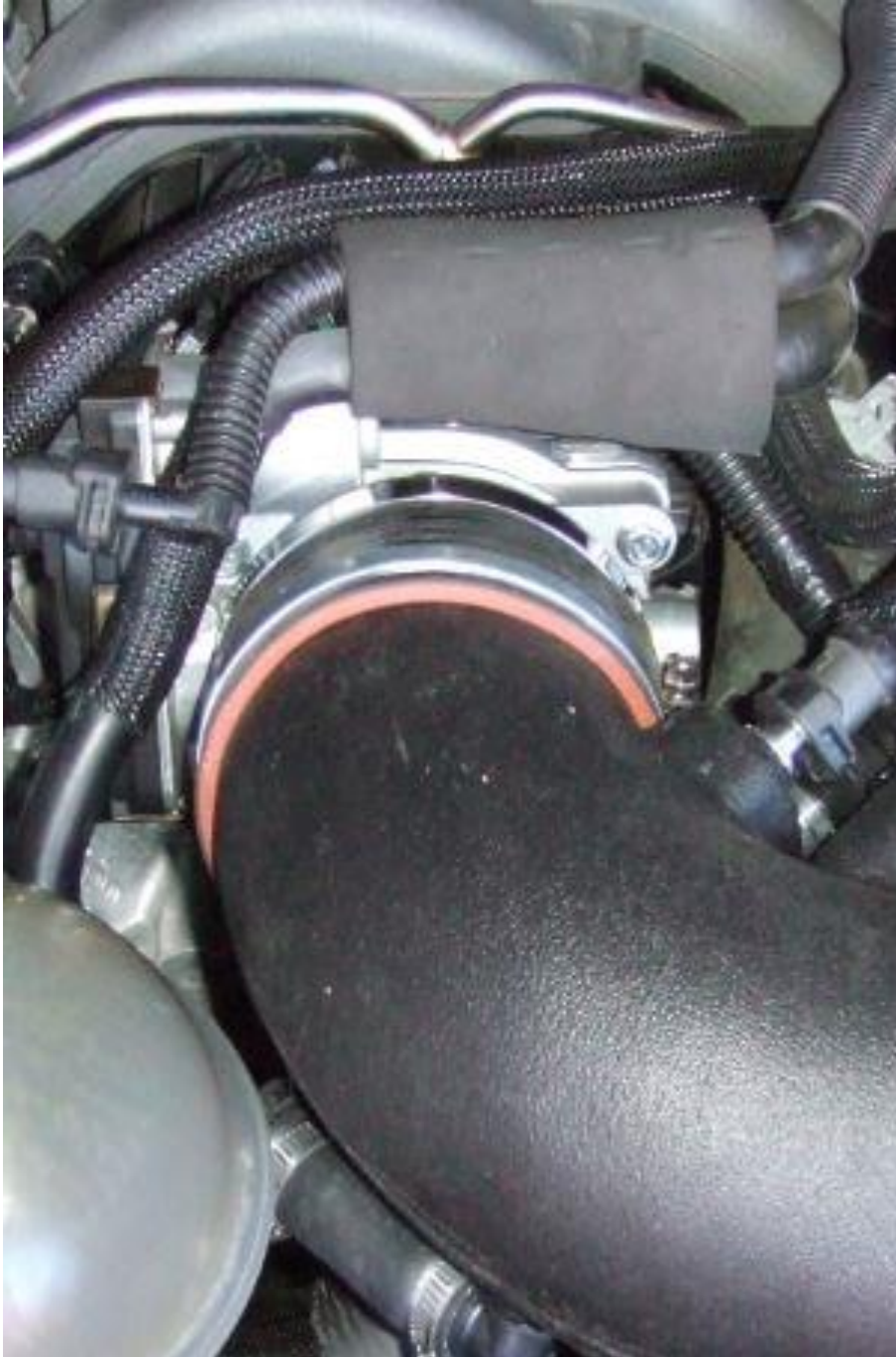
Installation Guide Created by American Muscle Customer Speros Voss on 11/20/2016