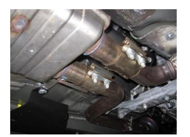
2. To remove your stock exhaust, unbolt it from the clamps located just after the manifolds then remove the whole exhaust system

3. Now install the passenger side muffler assembly #B by sliding the metal hangers into the rubber grommets. Then do the same for the driver side muffler assembly #A. Use clamp #D to secure together. Keep loose.