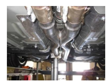
2. Install your Gibson x-pipe using the stock clamps. Be sure to keep loose until the entire system is in place.

4. Once you have entire system hanging loose re install the factory fram support bracket. Instal the forward bolt loosly and used the supplied spacers and bolts for the rear 6 bolts. Tighten down all the bolts.