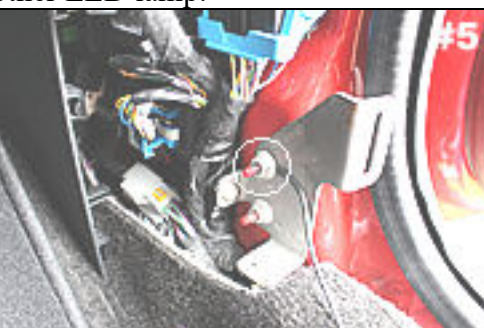
Attach black ground wire to the 10mm bolt circled above.