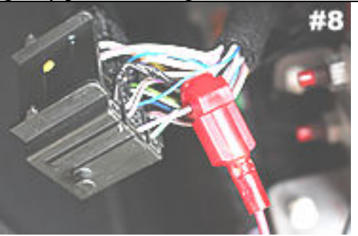
Plug red wire into the wire tap.