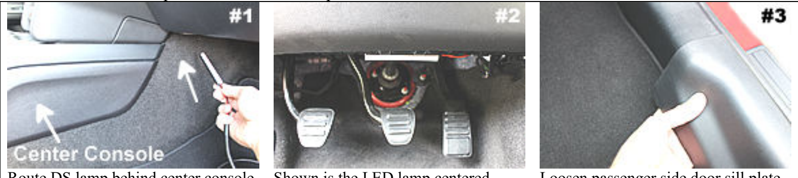
Route DS lamp behind center console to driver side.