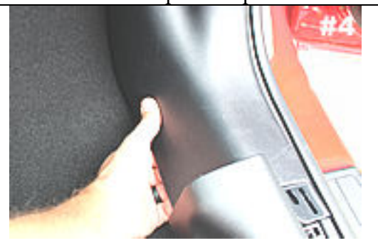
Remove kick panel shown. First pull upward, then backward gently.