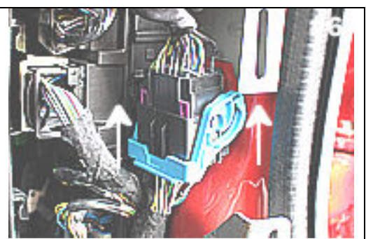
Lift blue bar upward to detach connector. It will 'click'.