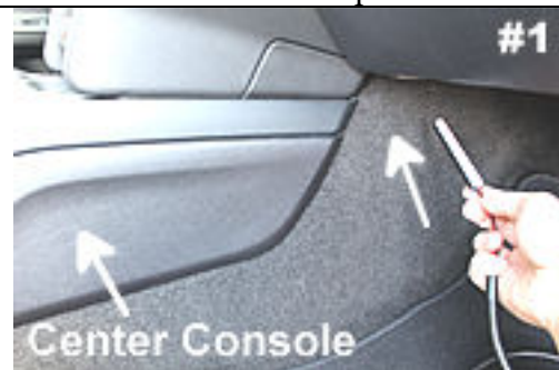
Route DS lamp behind center console to driver side.