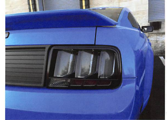
Step 6 Install the new tail light in reverse order.

Trouble Shooting: If using LED reverse light, always check the polarity. If needed, flip the bulb in the socket 180°. Cycling the key on and off may also be required.