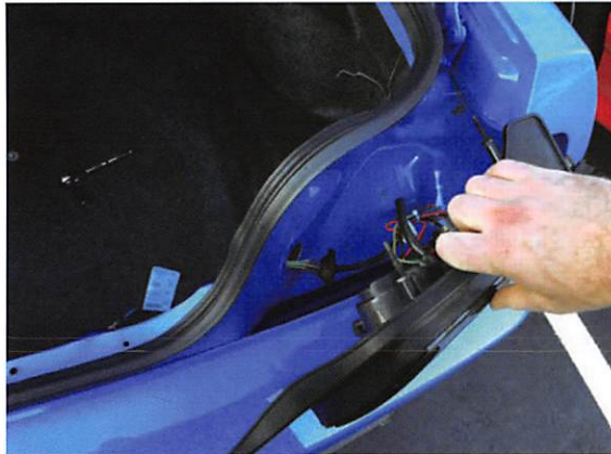
Step 4 Remove the tail light from the vehicle.