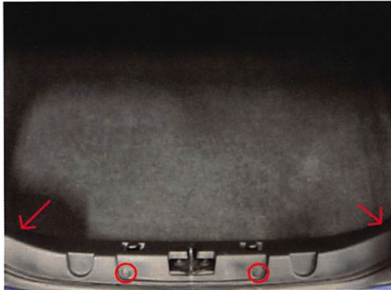
Step 1 Using a panel removal tool or pliers, remove the (2) lower clips on the trunk trim panel. Then unscrew the upper fasteners.