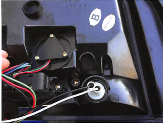
Step 5 Transfer the factory reverse bulb into the new tail light.