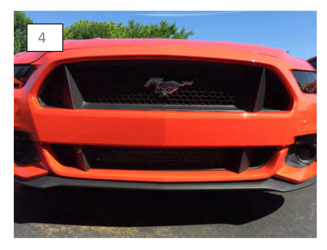
Apply firm even pressure to ensure proper adhesion to the factory grille.