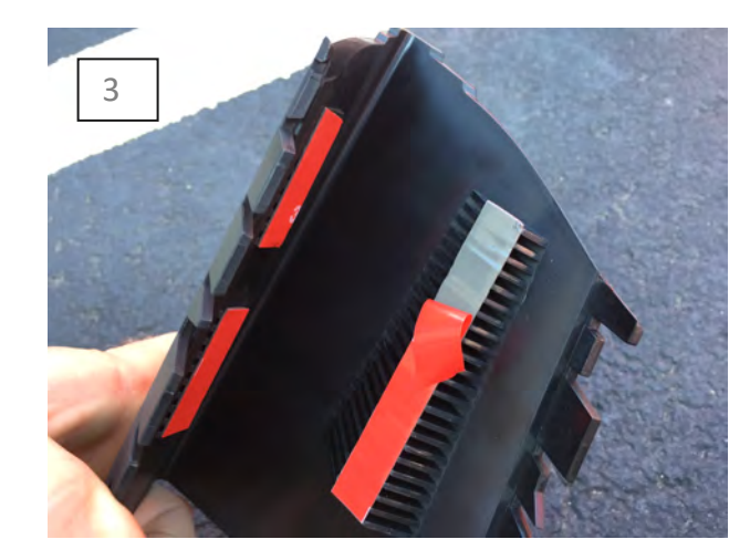
Remove the tape backing and apply the adhesion promoter. Allow the adhesion promoter to flash dry. Then position the grille extensions.