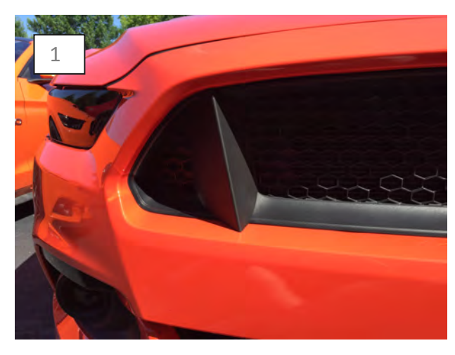
Begin by test fitting the extensions. **Note: which extension goes on which side.