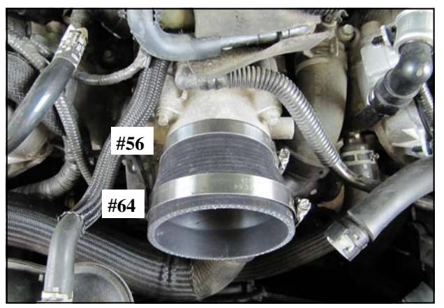
8. Install the Coupler and Clamps onto the throttle body as shown. Do not tighten the Clamps at this time.