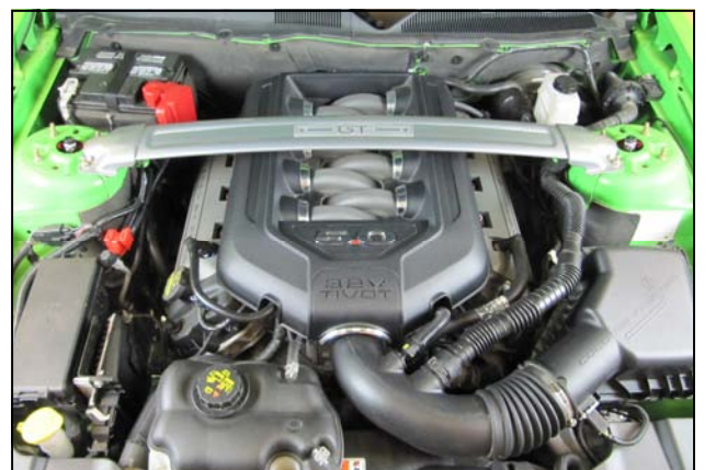
1. Disconnect the negative battery terminal. Remove the strut tower brace, if so equipped.