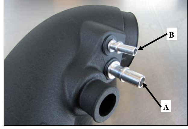
5. Install the Grommets and Fittings into the Modular Intake Tube. A) All models will require the use of the 5/8" Fitting and the 5/8"Grommet. B) Automatic transmission equipped vehicles will also use the 3/8" Fitting and 3/8" Grommet.