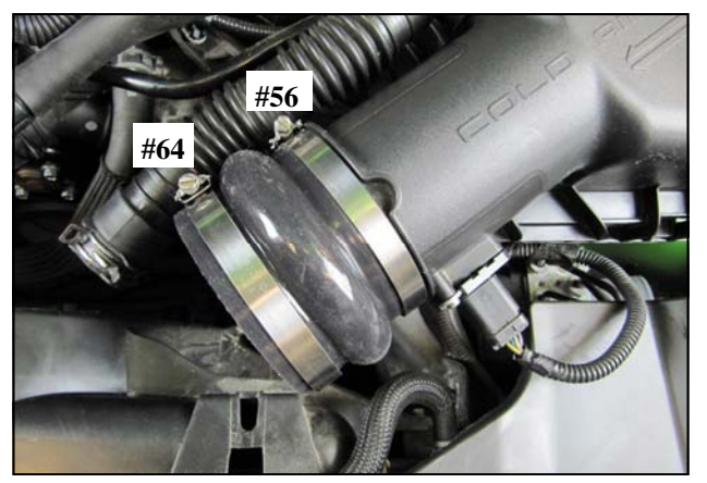
7. Slide the Hump Hose, one #56 Clamp, and one #64 Clamp onto the air box outlet as shown. Do not tighten the Clamps at this time.