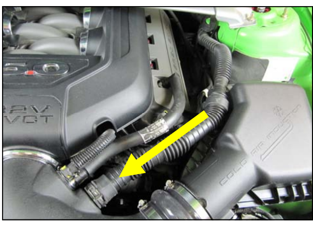
12. Resonator Delete Install Option: Airaid has made it possible to eliminate the factory induction resonator if you so desire. The removal of the resonator from the intake has no negative effect on the performance of this kit.