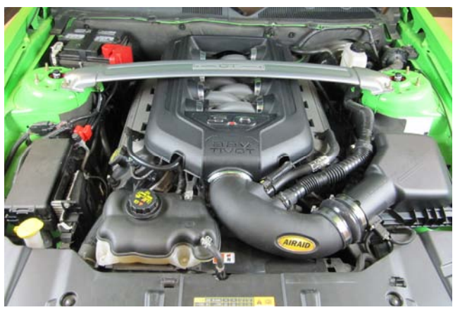
11. Reinstall the engine cover and Reinstall the strut tower brace, if so equipped. Reconnect the Battery terminal.