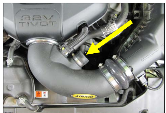
15. Install the Urethane cap with the 60mm Hose Clamp onto the Airaid Intake tube

Thank you for purchasing the Airaid Intake System. Contact Airaid @ (800) 498-6951 8:00 AM - 5:00 PM MST weekdays for questions regarding fit or instructions that are not clear to you. Your Airaid Intake System was carefully inspected and packaged. Check that no parts are missing, or were damaged during shipping. If any parts are missing, contact Airaid. The air filter element is protected from direct exposure to water and debris; care should be taken not to drive through deep water. WATER INGESTION IS THE DRIVERS RESPONSIBILITY! The air filter is reusable and should be cleaned periodically.