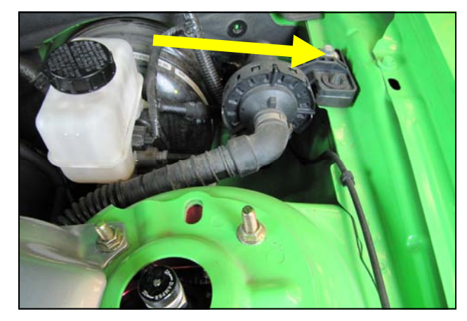
13. Remove the entire Resonator tube assembly and all associated stand offs from the intake tube and the vehicle. Remove the 6mm bolt securing the diaphragm housing to the inner fender remove the tubing from the Fire wall.