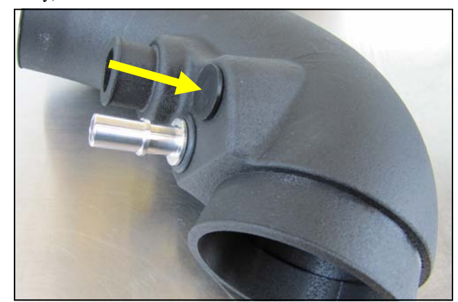
6. Manual transmission vehicles will not need the 3/8" components and will use the Blind Grommet.