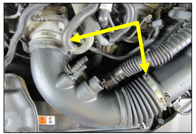
4. Loosen the hose clamps on the factory intake tube and remove it. If installing an Airaid Jr. kit, install the Airaid Premium filter into the factory air box at this time.