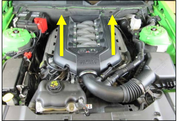
2. Lift straight up on the engine cover to unseat it from the mounting grommets and set it aside.