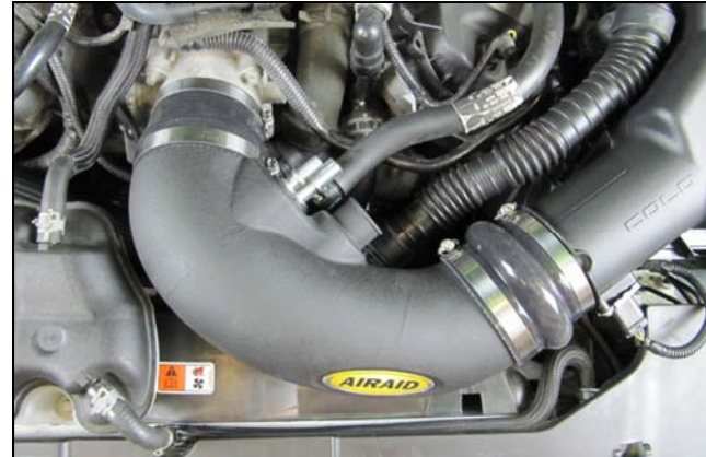
9. Insert the Intake Tube assembly into the Hump Hose first then into the Coupler on the throttle body. Align the components and tighten the Clamps.