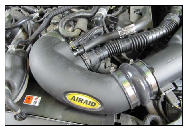
10. Connect the breather lines from step 3. to the Airaid intake Tube.