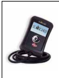
aFe Power Programmer