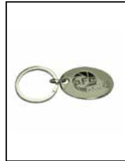
aFe Key Chain