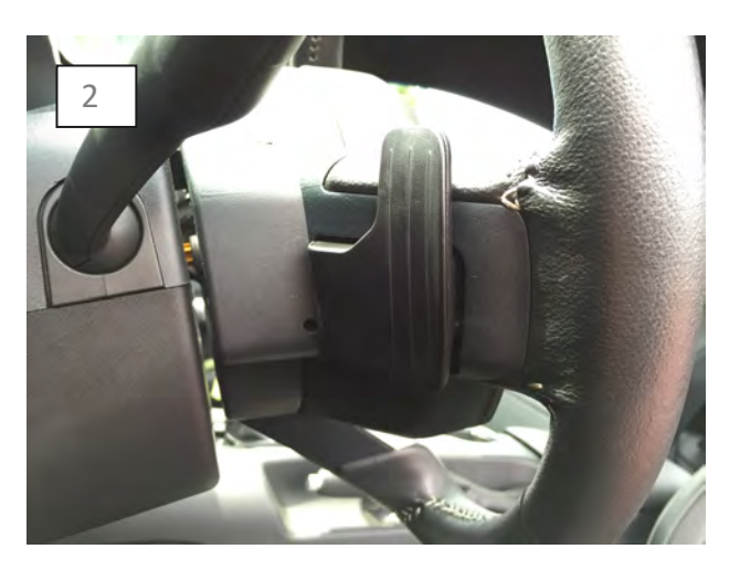
Clean the mounting surfaces with the supplied alcohol, allow time to flash dry.