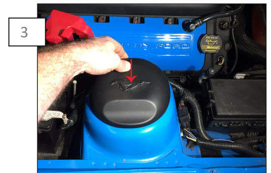
3 To remove the cover, first place pressure on the inner edge towards the outside of the car, then lift the inner edge up.