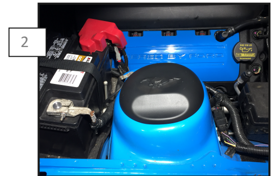
2 **Installation Note: If you have aftermarket struts the studs may be taller than the factory studs. If there is any interference between the aftermarket strut stud and the Strut Tower Cover, trimming of the stud will be necessary. Center the Strut Tower Cover over the strut tower (indentation facing the fender) and press the cover down to clip it into the strut tower.