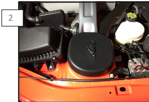
2 **Installation Note: If you have aftermarket struts the studs may be taller than the factory studs. If there is any interference between the aftermarket strut stud and the Strut Tower Cover, trimming of the stud will be necessary. Center the Strut Tower Cover over the strut tower and press the cover down to clip it into the strut tower.