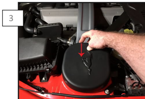
3 To remove the cover, first place pressure on the inner edge towards the outside of the car, then lift the inner edge up.