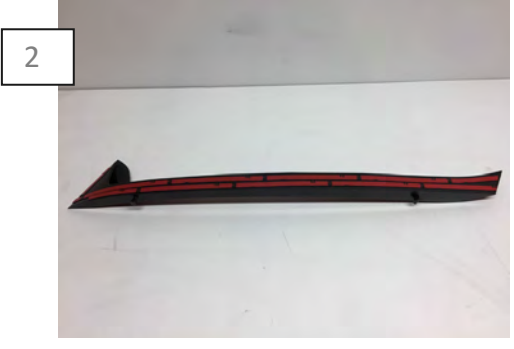
Prepare the fender vent by first installing the Fender Vent insert. Test fit the insert on the vent. Remove the insert and apply the supplied 3M double sided tape.