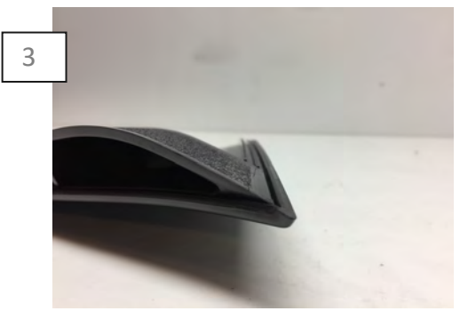
Test fit the insert again, ensure sure the end sit flush with the vent otherwise, the vent will not fit correctly on the car.

Wash the fenders with soap and water. Allow the panel to dry. **Recommended: Wipe the panel down with isopropyl alcohol to ensure the cleanest surface possible.