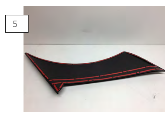
Install the 3M tape on the Fender vent as seen above. Before removing the tape backing, make yourself familiar with the way the vent fits on the vehicle.