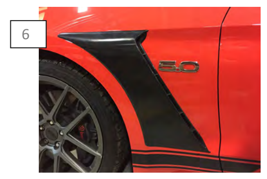
Peel off the double sided tape backing and apply the vent to the vehicle. Apply firm even pressure to ensure proper adhesion.