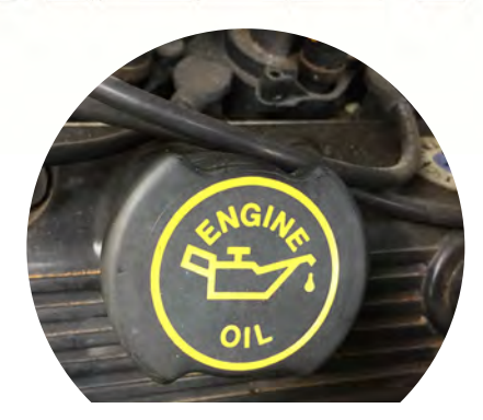
Oil Cap Installation : Remove the factory oil cap by turning it counter-clockwise. Then Install the Modern Billet Chrome Oil Cap.