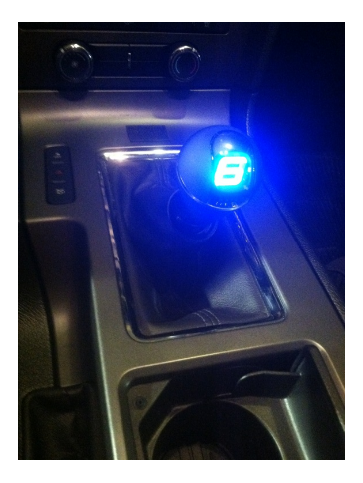
Installation Guide written By AmericanMuscle Customer Austin Ludden 3/10/2013