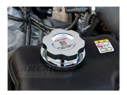
Radiator Cap Cover: Using the supplied alcohol wipe, clean the reservoir cap. Ensure the cap it tight. Test Fit the Modern Billet cap. Loosen the set Allen screw(s). Remove the double sided tape backing, place the cap over the reservoir and tighten the set screw(s).