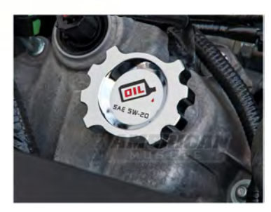
Oil Cap Installation : Remove the factory oil cap by turning it counter-clockwise. Then Install the Modern Billet Chrome Oil Cap.