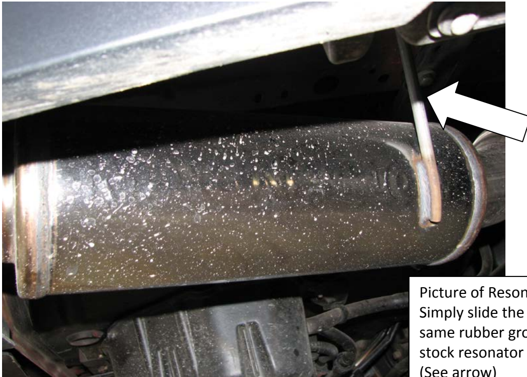
Picture of Resonator installed. Simply slide the rod into the same rubber grommet the stock resonator came out of. (See arrow)