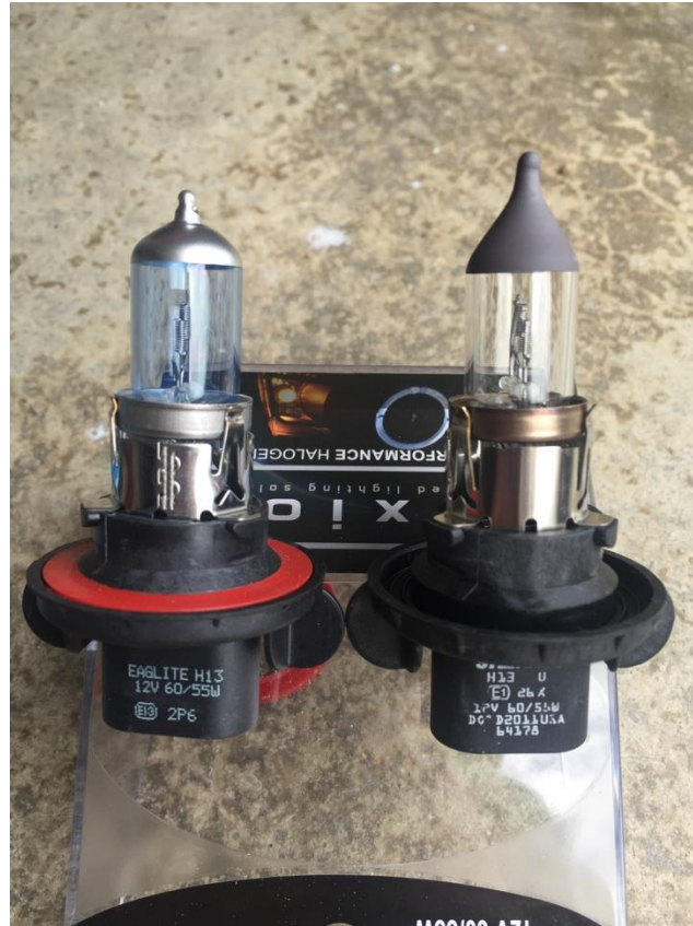
(Left: Raxiom Bulb; Right: Factory Bulb)

CAUTION: BE CAREFUL WHEN HANDLING THE NEW HEADLIGHT BULB. TO INSURE 100% PERFORMANCE OUT OF THE BULB, KEEP THE GLASS OF THE BULB FREE OF DIRT, DEBRIS, AND FINGERPRINTS. IF THE BULB IS NOT CLEAN, CAREFULLY WIPE THE DEBRIS AWAY WITH RUBBING ALCOHOL ON A PAPER TOWEL.